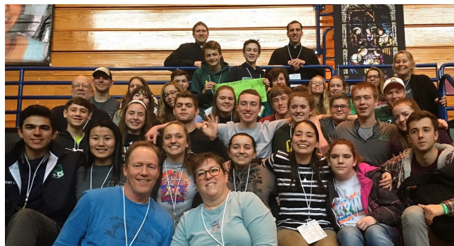
Join us for Mount2000!!! Signups have started!

MAC-PAC (Middle Schoolers Acting in Christ – Prayer, Action, Charity) is for 6th, 7th and 8th graders. The goal is to inspire, to grow our love for God and neighbor, and to provide fellowship for the Middle School youth of St. Francis De Sales. We usually meet the 2nd Sunday of the month. Watch this column for upcoming events!