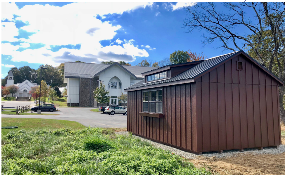
New Religious Education Shed

33rd SUNDAY IN ORDINARY TIME NOVEMBER 18, 2018