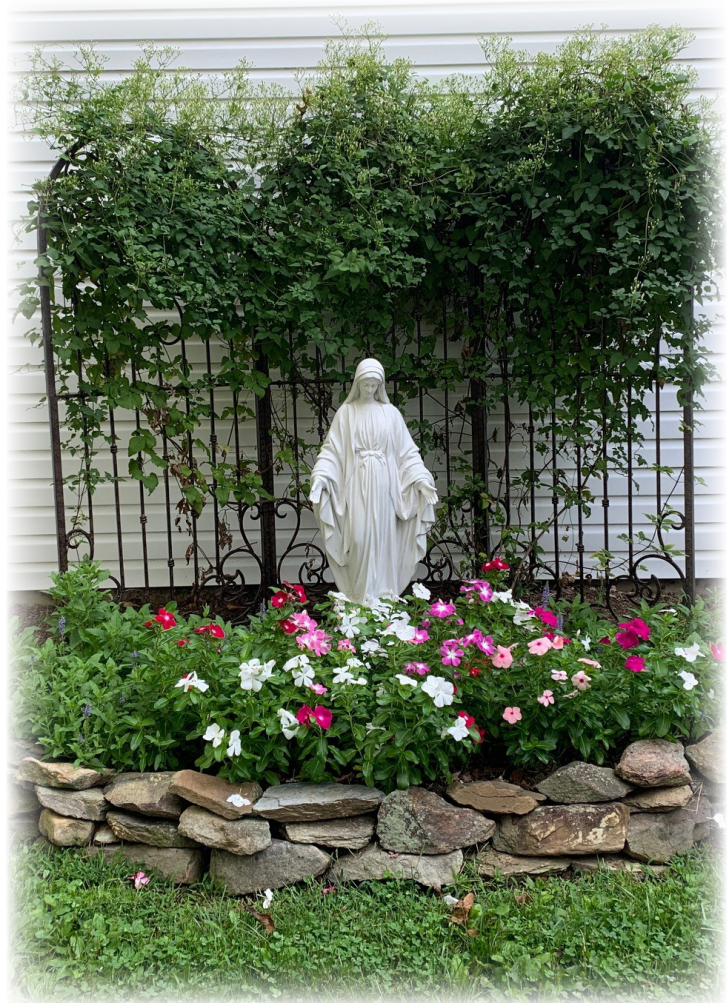
May is the month dedicated to Mary

Friday - Adoration is held every Friday following the 12noon Mass through the evening and overnight until Saturday morning before the 9am Mass Wednesday Holy Hour at 7pm