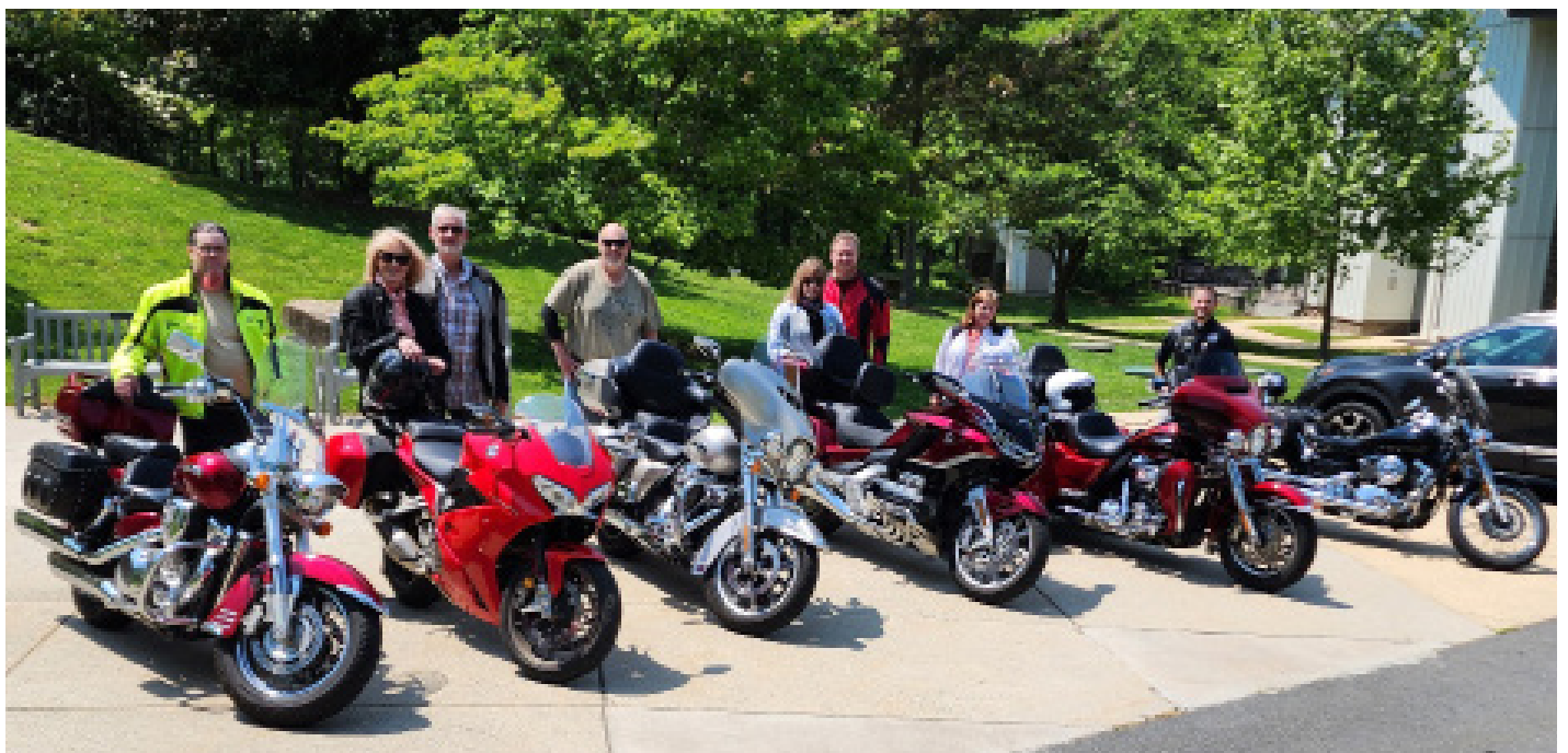
Blessing of the Motorcycles Sunday, May 21