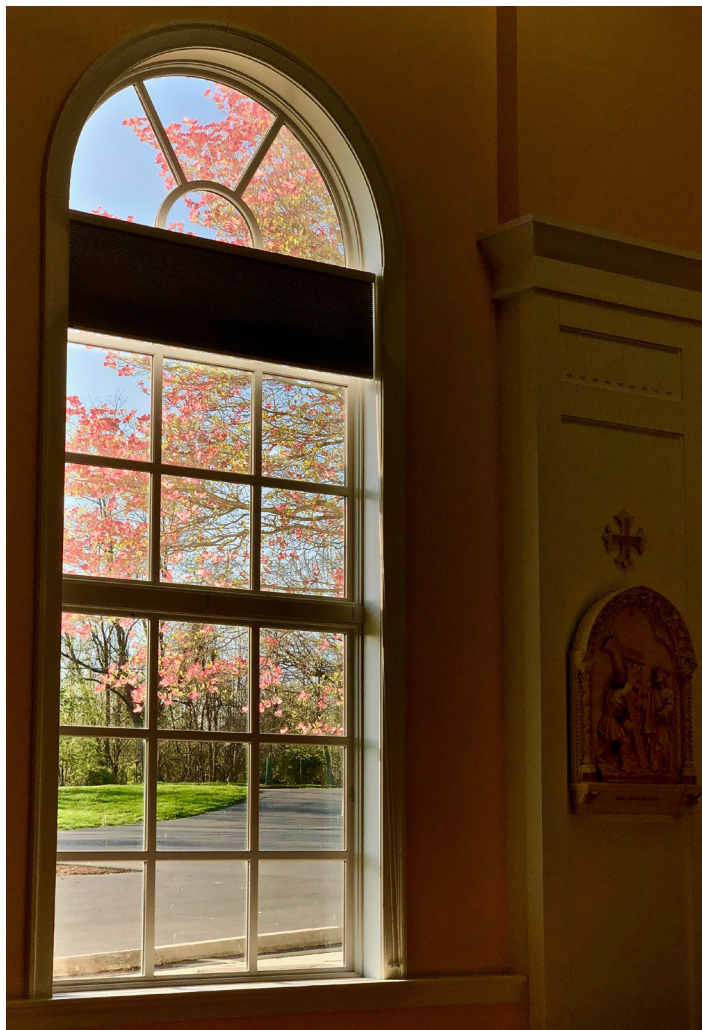
Springtime 2018 Church Window View

Anointing of the Sick: We are privileged to bring Holy Communion and administer the Holy Anointing to the sick and homebound upon request. Please call the office to let us know your needs.