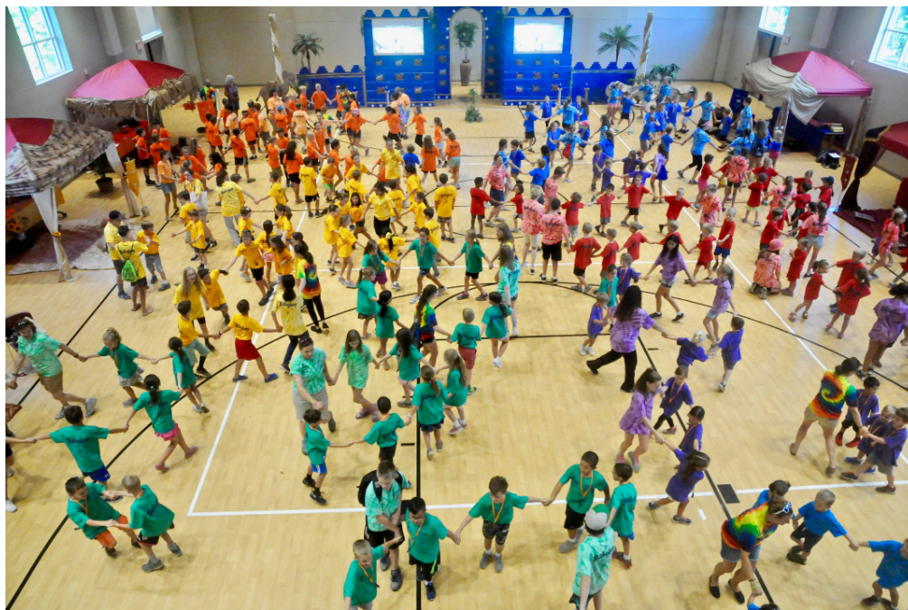
Vacation Bible School 2018

15th SUNDAY IN ORDINARY TIME JULY 15, 2018