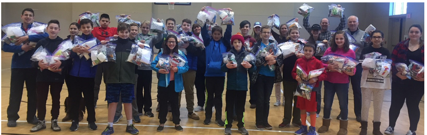
Blessing Bags for the needy!

Let us learn to calm our anxieties about our spouses by exploring each other during a Worldwide Marriage Encounter (WWME) weekend. The next weekends are: Mar 2-4, 2018 in Herndon, VA and Sep 21-23, 2018 in Herndon, VA. Early sign up is recommended. For more information visit our website at: RenewMarriage-VANorth.org or contact us at applications@renewmarriage-vanorth.org or 703-646-1521.