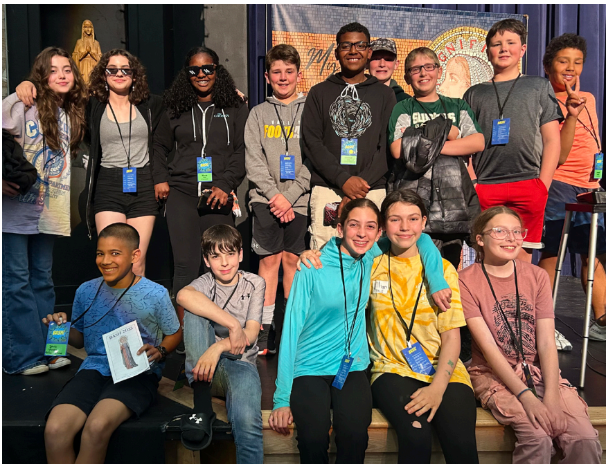
Middle School Diocesan BASH. Our kids had a blast!

www.signupgenius.com/go/10C0F4FABA822A6F9C43-mayfamily