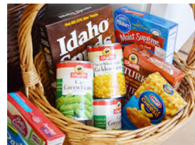
Please remember your Thanksgiving Donations!