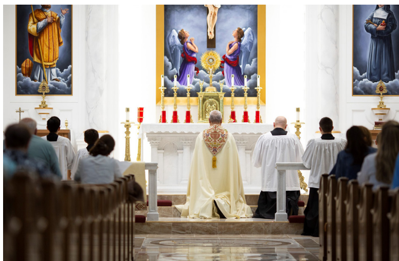
Parish Eucharistic Procession & Adoration during Rosary Coast to Coast (October 7, 2018)