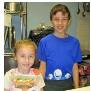
Photos of some of our Homeless Ministry volunteers at the October soup kitchen