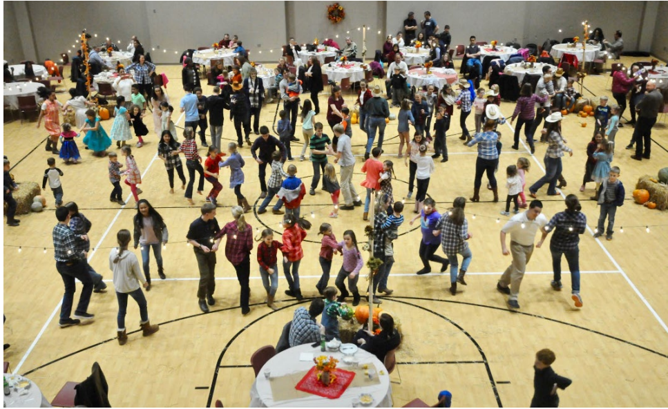
Fun time at the Parish Autumn Harvest Hoe Down (November 17)

Our Lord Jesus Christ, King of the Universe November 25, 2018