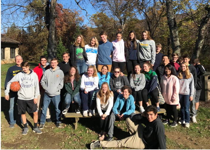
A great Fall Youth Retreat 2018, thanks to all who made it possible!!