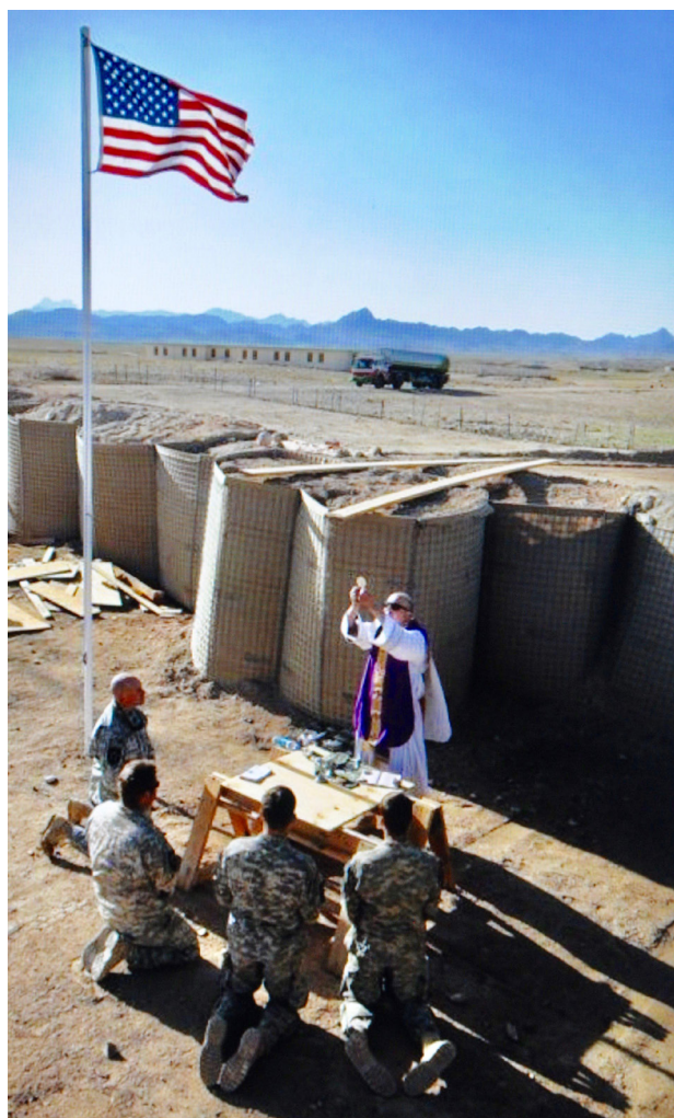
God bless and protect our military veterans. Happy Veteran's Day!

Anointing of the Sick: We are privileged to bring Holy Communion and administer the Holy Anointing to the sick and homebound upon request. Please call the office to let us know your needs.