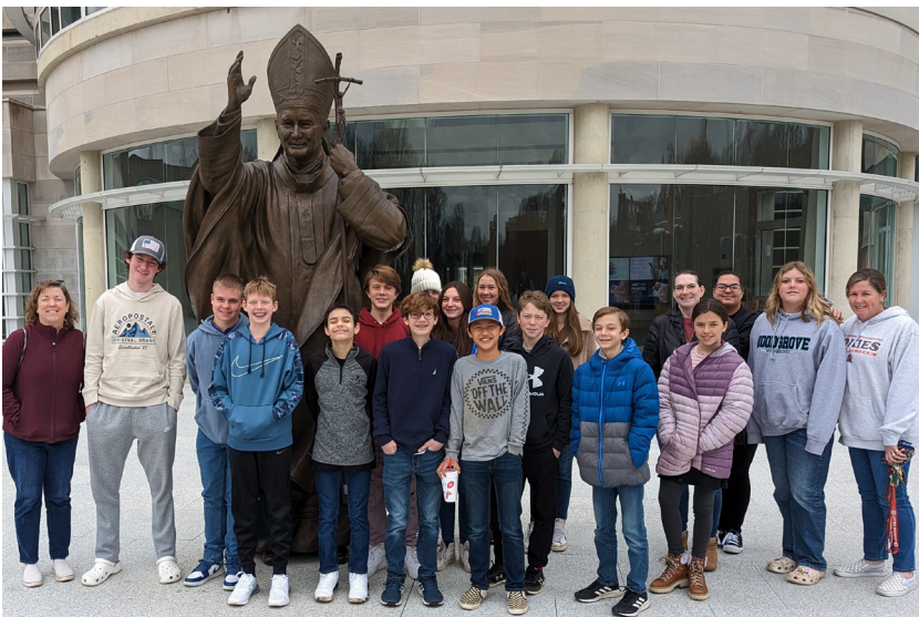
8th Grade Confirmation Retreat to Saint John Paul II National Shrine in DC