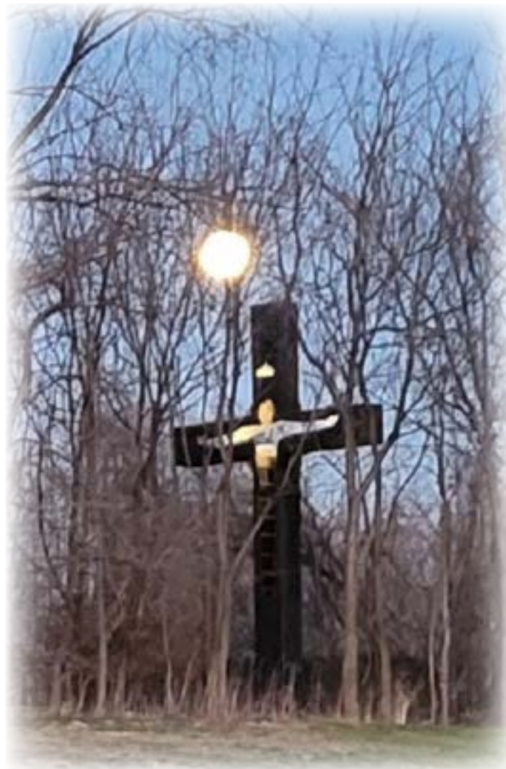
Father Gould captured the full moon rising behind Crux Gloria

Friday - Adoration is held every Friday following the 12noon Mass through the evening and overnight until Saturday morning before the 9am Mass Wednesday Holy Hour at 7pm