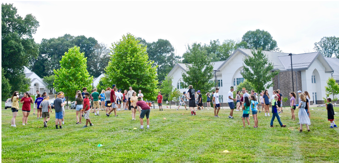
MAC-PAC Middle School Catholic Summer Camp 2018

16th SUNDAY IN ORDINARY TIME JULY 22, 2018