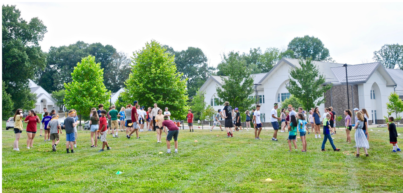
MAC-PAC Middle School Catholic Summer Camp 2018

16th SUNDAY IN ORDINARY TIME JULY 22, 2018