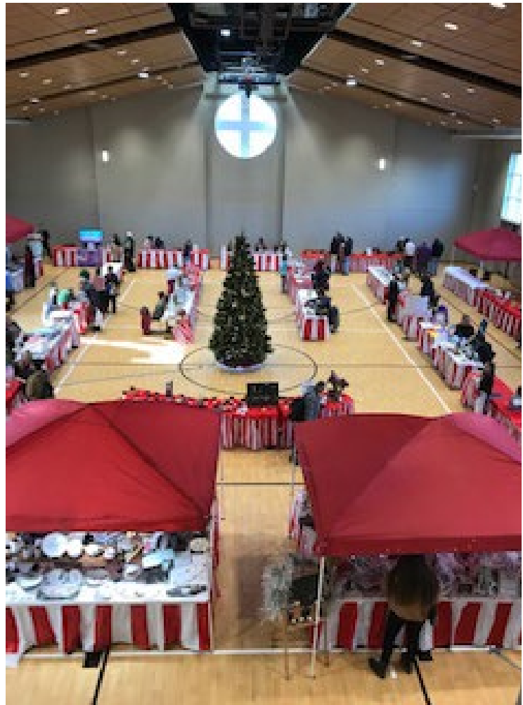
Christmas Market Village 2018 (before the big crowds arrived!)

Anointing of the Sick: We are privileged to bring Holy Communion and administer the Holy Anointing to the sick and homebound upon request. Please call the office to let us know your needs.